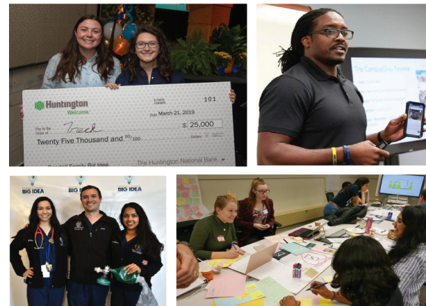
*All featured photos were taken at Big Idea Center events prior to the university shutdown in Spring 2020

Our main goal at the Big Idea Center is student success during their time at the University of Pittsburgh and beyond. The definition of "success" is different for everyone, but we are confident that we can be a valuable resource to you no matter what your long-term goals may be. Did we mention that everything that we offer is free to Pitt students? All it costs is your time and effort. We hope to see you soon!